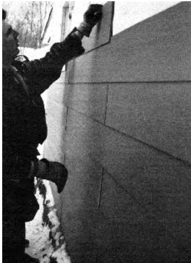
Some of the new hardboard products, such as MacMillan Bloedel's lap siding shown above, offer greater durability with blind nailing and long-warranty factory finishes.

All agree, however, on what factors are critical to hardboard performance. Moisture absorption topped the list, followed by quality of installation, joint performance, and manufacturer support.