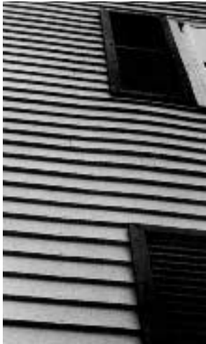
Figure 1. This hardboard has absorbed excessive moisture and expanded, causing buckling and bowing. Note how tight and swollen the butted joints are.