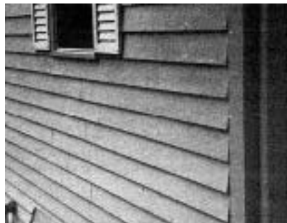
Figure 3. Undersized corner boards have aggravated the expansion problem on this installation by allowing moisture access to the ends of siding panels. Corner boards should fully cover the ends of the siding.

Given the success of MacMillan-Bloedel's product and the competition hardboard is getting, the hardboard industry will likely move toward more low-maintenance products in the next few years. Peter Armstrong of MacMillan-Bloedel says, "People continually ask for a prefinished system with as little maintenance as possible. So we're trying to promote our four prefinished product lines, all [with] lap siding, hid-