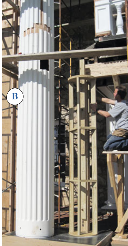
Figure 9. A round support pedestal (A) was built to replace the Parallam post in the old corner column. After carefully checking its final position on the porch (B), the carpenters slid the pedestal — dubbed “the plug” — into the column (C), where it was secured with lag screws driven from the outside. The raw wood of the scribed column was primed (D) before final installation.