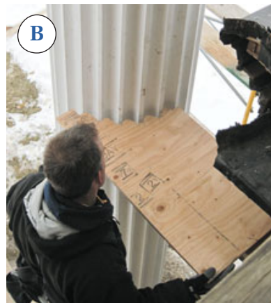
Figure 7. At the end of the colonnade, the carpenters used one of the old columns to practice scribing to the adjoining porch roofline (A). A plywood template helped in orienting the flutes to the existing trim (B). Where the support beam of the adjacent deck dies into the column, a recip saw (C) was used to create the beam pocket (D).