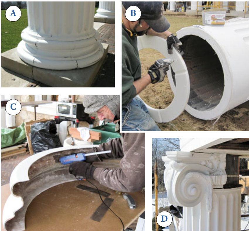
Figure 5. To prevent the moisture degradation that had affected the existing columns (A), the crew installed polycarbonate spacers on the bottoms of the new columns, thus isolating the wood from the damp stone plinths (B). Two-piece fiberglass bases replaced the old wooden ones (C); vent holes drilled in the bases were covered with screen to keep bugs out. The original fiberglass capitals (D) were salvaged and reused.

for the new columns between the bottom of the architrave and the top of the limestone plinth — only about \frac{3}{4} inch — there was no way to move the column into place with the strap attached. So we fashioned a cradle for the lift that allowed the operator to pick up the column by the shaft. Working from the scaffolding, we attached the columns to the cradle with three ratchet straps, then the lift operator — with a very steady hand — inched them into place. We also used the cradle for removing the original columns.