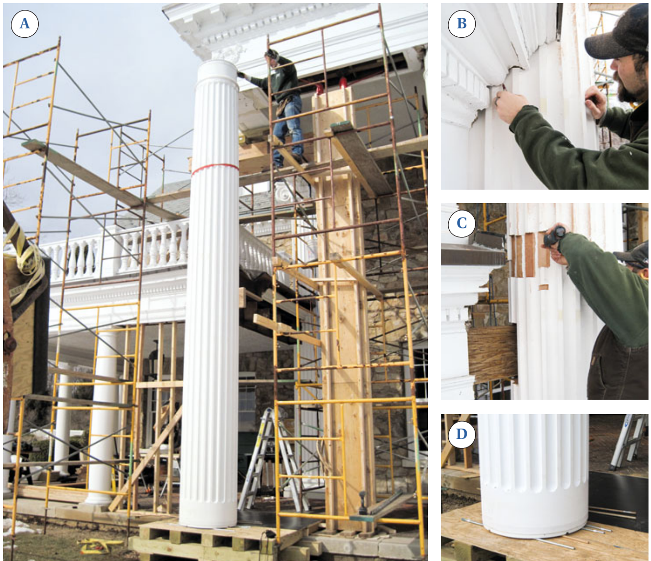
Figure 8. Once the practice column was moved, the new corner column was set in place (A). In a series of back-and-forth moves, the column was scribed and fitted to the adjoining trim (B, C). To facilitate the process, the crew created a solid, level base covered with plastic laminate just in front of the column's final location (D). They experimented with rollers, but found that two men could slide the column across the slippery laminate without them.

Because of all the scribed trim and intersecting rooflines (Figure 6, previous page), the columns at each end took a lot longer to