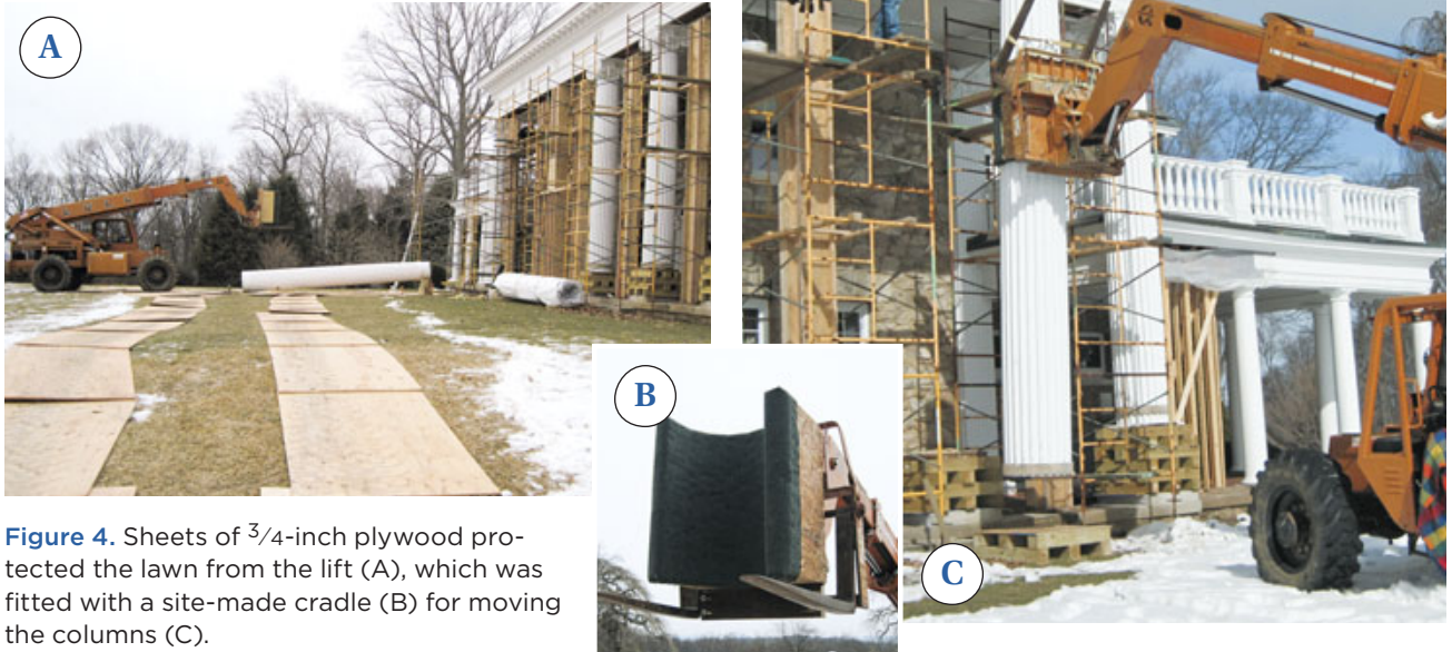
Figure 4. Sheets of \frac{3}{4} -inch plywood protected the lawn from the lift (A), which was fitted with a site-made cradle (B) for moving the columns (C).