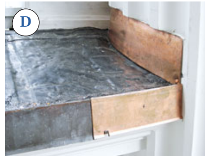
Figure 10. The finished job matches the original perfectly (A). The original two-piece fiberglass capitals were reinstalled (B) and new trim scribed to fit (C). Where adjoining roofs meet the column, a rubber membrane was adhered to the shaft, then covered with copper (D).

column into place “empty” to test fit it — to the end of the beam, the entablature moldings, and the porch railing. Once we were satisfied, we had to move the column back onto a set of horses so we could install the plug, which we did by pushing the snug-fitting assembly inside and securing it with LedgerLok screws driven from the outside.