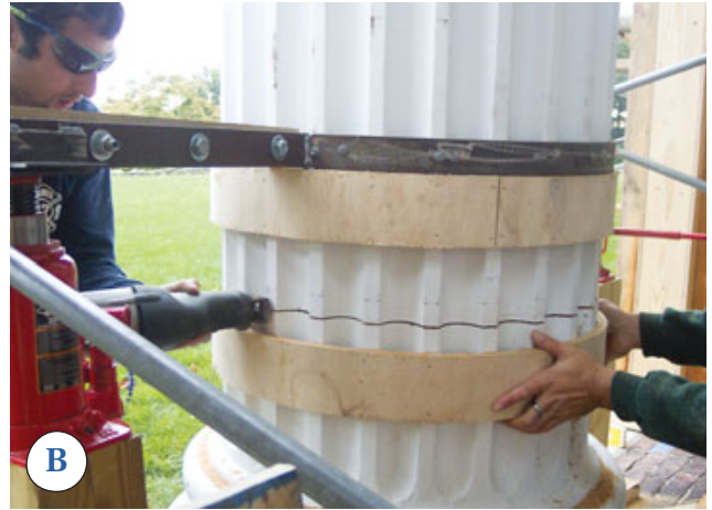
Figure 2. The original plan was to replace only the column bases. Accordingly, the crew installed structural steel clamp rings around the shafts (A) and shifted the weight from the pedestals to the concrete porch using 20-ton hydraulic jacks. Rings of bending plywood served to guide the cutting of the wood columns, which was done with reciprocating saws (B) and circular saws (C). Removing the bases (D) confirmed that the interiors were delaminating and that the columns would have to be replaced.