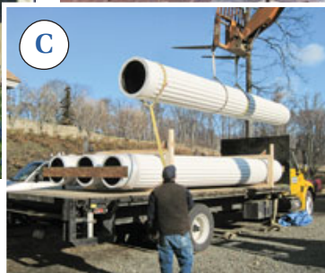
Figure 3. After cutting away the bases (A), the crew placed cribbing under the shafts (B) while awaiting the delivery of new columns (C).