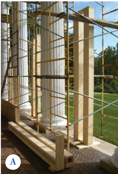
Figure 1. To temporarily support the porch roof while the columns were replaced, the carpenters built posts from 10-foot-long 2x4s and 2x6s (A). The double-post assemblies were joined by top and bottom plates stacked two high (B), then sheathed with 1/2-inch plywood (C). Full-length 2x4 strongbacks were added to the outside for rigidity.

We moved the columns from the staging area using a pair of straps. Once the column was in front of its final location, the lift operator used a single strap attached near its top to swing it into a vertical position and set it on a temporary platform in front of the porch, where we secured it to the scaffolding for stability. Because there was so little clearance