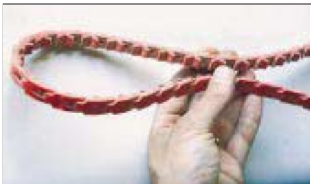
Figure 1. The weird-looking Red Power Twist Belt from Inline Industries is a series of linking segments, each of which is just over 1 inch long.

Another problem area is the pulleys themselves. The tiniest imperfection in the manufacture of these parts can cause them to wobble and contribute