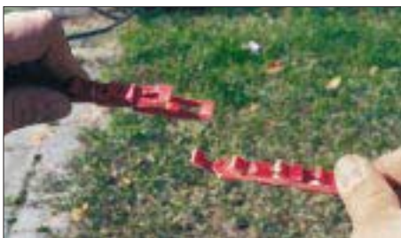
Figure 2. To make the final connection, the longer tab goes through both layers of the slotted piece, while the shorter tab goes through just one. Once you've turned the tabs, the belt is locked.