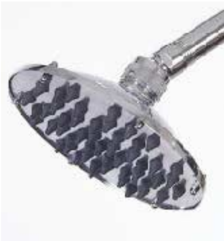
Figure 3. Big-diameter multi-jet showerheads, like this one from Jaclo, provide a rainshower effect by increasing the area of shower coverage with up to 90 jets in a single head. Rubber nibs dislodge mineral deposits at the flick of a finger.

head, body jets, and handheld massage spray. All that's required is connection to hot and cold water lines, making for an uncomplicated shower remodel. Hansgrohe's basic Exclusiv panel and Kohler's BodySpa both start in the $2,500 range. For a multiple head shower to be effective, however, water pressure had better not be a problem. A Hansgrohe technician advises that the minimum satisfactory working pressure of the supply is 44 psi.