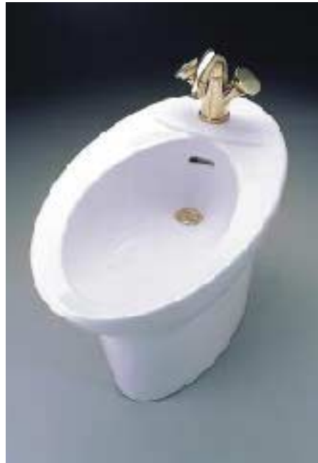
Figure 5. The bidet is struggling onto our shores in growing numbers and versions, from “multi-tasking” heated toilet-seat replacements (Toto’s Chloe, $700, at left) to dedicated fixtures. The preferred location for a dedicated bidet (right, from Toto) is adjacent to the toilet.

merging global cultures is the growing promotion of bidets and toilet/bidet combinations, with retractable water jets and adjustable pressure (Figure 5). Taken for granted elsewhere, bidets — like soccer, until recently — are still playing catch-up in the U.S. The Kitchen and Bath Business 2000 Market Forecaster predicts that around 98,000 bidets will be installed in the U.S. this year. Just don’t call it a Euronol.