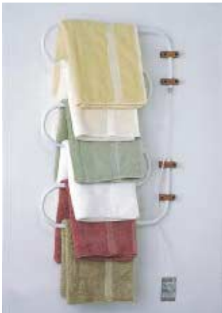
Figure 6. Towel warmers win instant converts on contact. Hinge-It’s electrically heated Model 3200 (above) starts at $120 in coated steel, with stainless steel and brass tubing available at a higher cost.