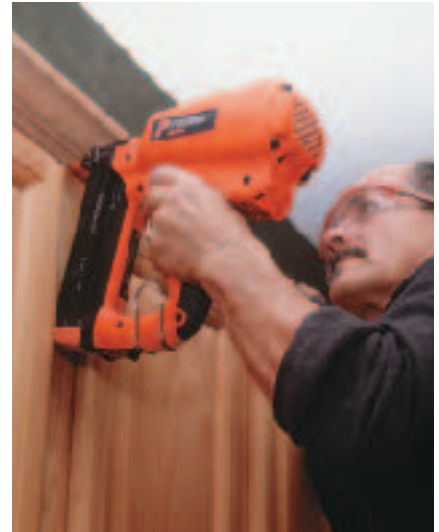
Paslode's IM200F18 brad nailer is heavier and larger than a pneumatic, but then there's no hose.

Brads load easily from the side of the magazine, and you can see how many fasteners remain in the tool while you're using it. The angled finish nailer stops firing when empty to save fuel and avoid marring your work, and I wish such a lockout had been included on this gun. Because the driver blade leaves a small hole whether or not it drives in a fastener, it's not always clear if a brad is holding your work.