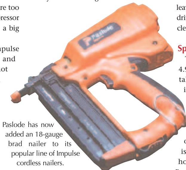
Paslode has now added an 18-gauge brad nailer to its popular line of Impulse cordless nailers.

The soft-grip handle has a good feel, and the reach to the trigger is less of a stretch than on the angle finish nailer. This is especially important when you're working overhead and your fingers tend to roll away from the trigger. The trigger is comfortable and takes only a light squeeze. A light near the trigger alerts the user when the battery needs a charge. At the other end of the handle is a belt hook. I wish all nailers had a factory belt hook. This one is sturdy and well designed.