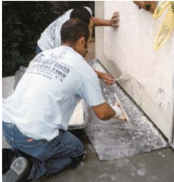
Figure 7. Stucco siding repairs follow the original three-layer process of scratch coat, brown coat, and color coat. A narrow strip of the sheet-metal flashing is left exposed to allow crack-free movement between wall and deck.

Once the texture coat can be walked on, we complete the patching of the stucco siding, following the original steps of 60-minute building paper, stucco lath (wire), scratch coat, brown coat, and a color and texture coat. Usually, we're patching small areas, so we use a quick-drying mortar mix to help expedite the job (Figure 7). We take the stucco down over the apron flashing but not all the way to the deck, leaving a narrow band of metal exposed. This allows for some necessary structural movement and elimi-