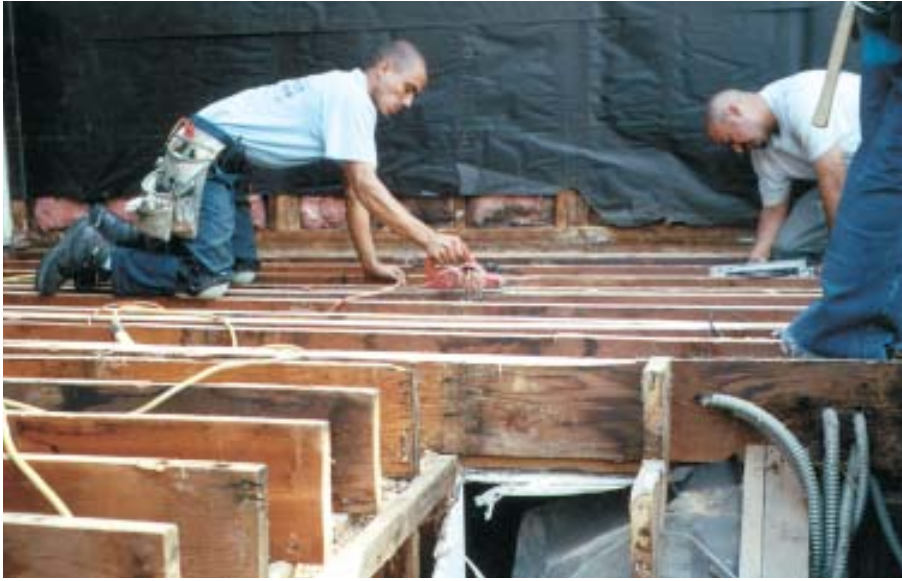
Figure 3. To eliminate puddling, the author rips a 1/4-inch-per-foot taper from the top edge of the cantilevered joists, creating a positive drainage slope. A power planer cleans up the cut.