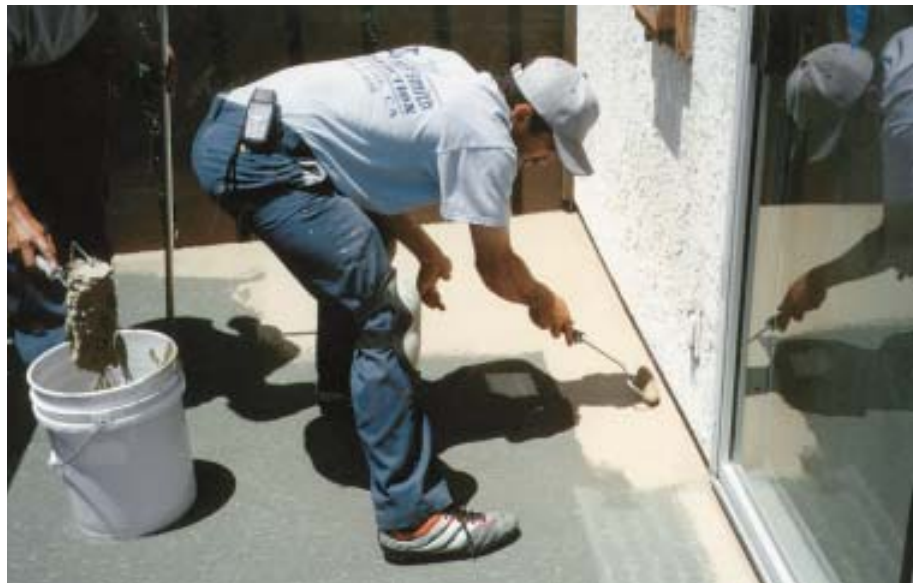
Figure 8. A final, acrylic color coat seals and protects the multilayered deck system from water absorption.