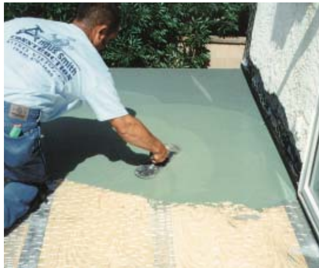
Figure 6. Galvanized expanded metal lath, thoroughly stapled to the plywood deck, reinforces the cementitious waterproofing membrane. Plywood expansion joints are isolated and protected from filling by a proprietary seam tape.

In replicating the original closed or open railing system, we pay strict attention to the sequence and detailing of the flashing. (Incredibly, we often find that the original flashing was mindlessly installed to trap rather than shed water.) Where the railing abuts the building, we break back the stucco