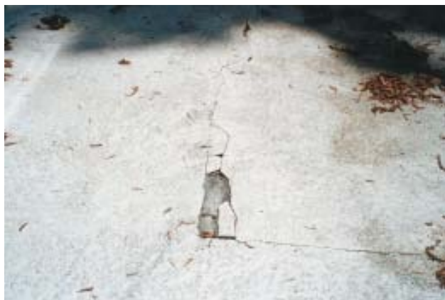
Figure 1. Surface cracks in a balcony's waterproofing are often the first sign of hidden structural damage. Cracks typically appear above joints in the plywood deck sheathing.

Railing systems are usually solid half walls rather than open assemblies,