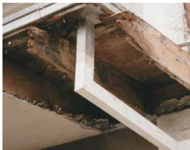
Figure 2. Improperly flashed scuppers (left) and floor drains (right) often allow water into the framing, leading to hidden rot.