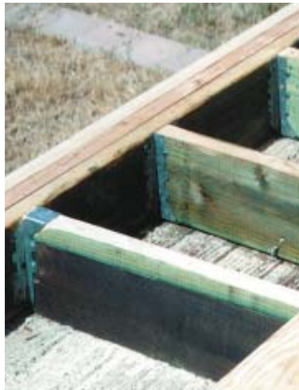
Figure 4. Joists that are too far gone to repair must be replaced between the wall plate and the new double rim joist (left). The rim hangs at the ends of the intact cantilevered joists on upside-down joist hangers. The replaced “cripple joists” are hung conventionally (right).

rather than replacing them. Rot is often concentrated in the outermost 6 inches of the joists and along the upper edges, where nail penetrations have allowed water in. We cut the damaged ends back to healthy wood and sister new, 6-foot-long joists of equal dimension alongside, using two carriage bolts at the center and two at each end to tie the joists solidly together. To make a neater-looking repair and provide full nailing for the deck sheathing and trim, we fill in the end cuts with blocks of lumber.