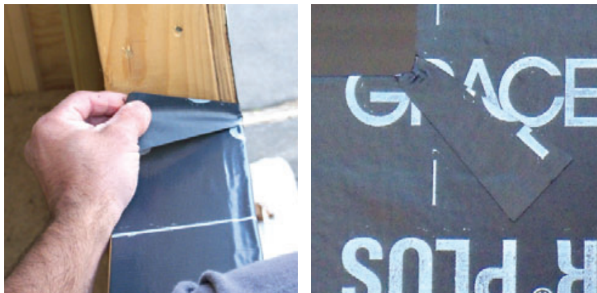
Figure 4. One end of a bow tie is adhered to the flashing membrane outside the opening, the other half folded to the inside (left). When applied correctly, the narrow center section will turn neatly up the corner of the opening (right).

Cutting the flashing membrane. There are two separate sets of flashing pieces: the inner pieces that are applied to the sheathing and fold back over the framing, and the outer pieces that cover the window flanges. I cut both sets at the same time, determining their lengths by measuring directly from my markings on the housewrap. To calculate the width of the inner pieces, I add the distance the lines are set back from the opening to the depth