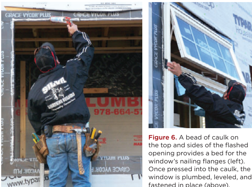
Figure 6. A bead of caulk on the top and sides of the flashed opening provides a bed for the window's nailing flanges (left). Once pressed into the caulk, the window is plumbed, leveled, and fastened in place (above).

Flashing the sill and sides. The sill piece is applied first. If the rough openings have been sized to allow it, I'll tack a full-length piece of clapboard to the rough sill before applying the membrane, creating an outward slope that will cause any water that somehow makes its way past the window to drain to the outside. In practice, though, this isn't always possible — I had to omit the clapboard from the job photographed here because including it would have left insufficient clearance at the window head.