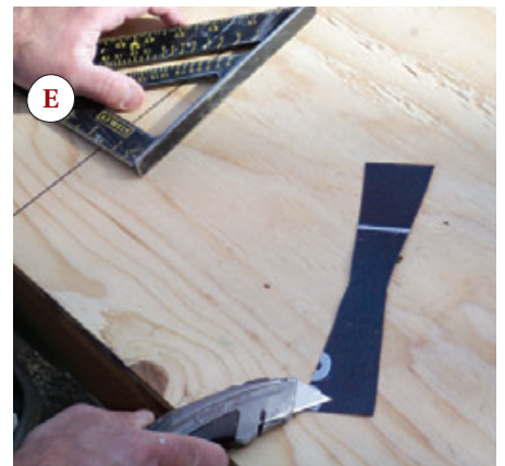
Figure 2. Transferring the dimensions of the flashing pieces to a plywood story board makes it easier to cut them accurately to length (A). Each piece is then folded lengthwise twice (B) so it's short enough to cut against a standard framing square (C). Corner pieces, or bow ties — measuring about 1½ inches by 8 inches overall — are cut from scrap material (D, E).