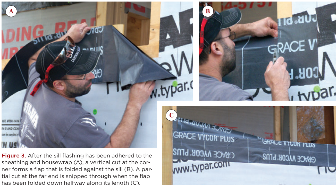
Figure 3. After the sill flashing has been adhered to the sheathing and housewrap (A), a vertical cut at the corner forms a flap that is folded against the sill (B). A partial cut at the far end is snipped through when the flap has been folded down halfway along its length (C).

the edge of the opening at the top (see Figure 1 ). I then make a 6-inch cut at each of the top corners, angled back from the opening at 45 degrees, and temporarily tuck the resulting flap under itself to get it out of the way.