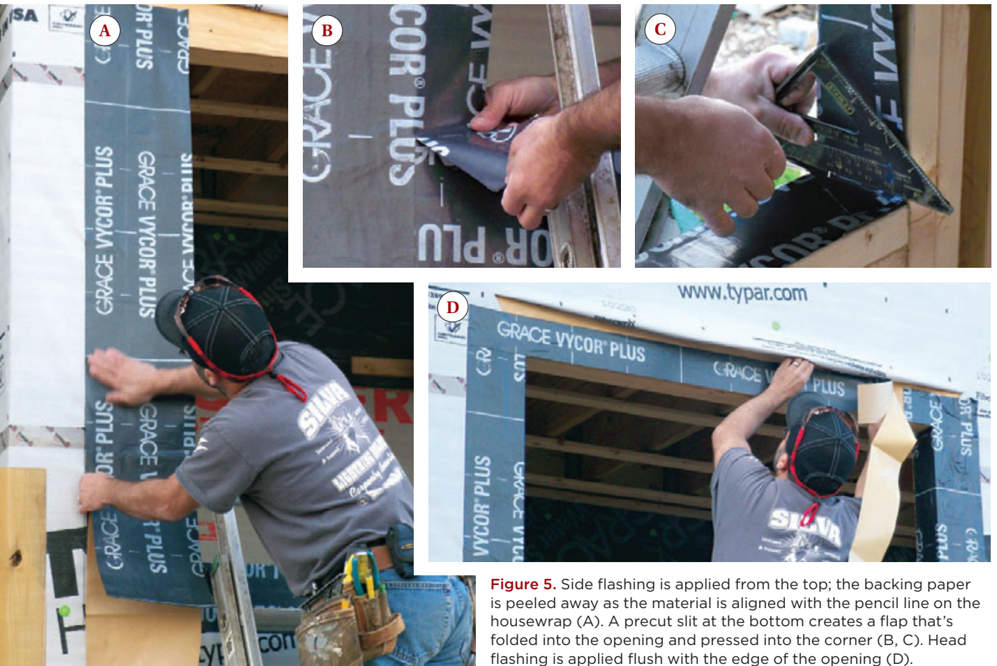
Figure 5. Side flashing is applied from the top; the backing paper is peeled away as the material is aligned with the pencil line on the housewrap (A). A precut slit at the bottom creates a flap that's folded into the opening and pressed into the corner (B, C). Head flashing is applied flush with the edge of the opening (D).