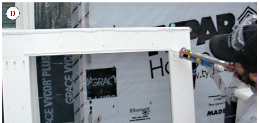
Figure 10. The backs of the prepared sill and casings are drilled for pocket screws (A). Facing surfaces are then coated with PVC cement and temporarily clamped together while the screws are driven (B). Next, the completed trim assembly is drilled for the deck screws that will fasten it to the framing, and caulked on the back before being lifted into place (C, D).