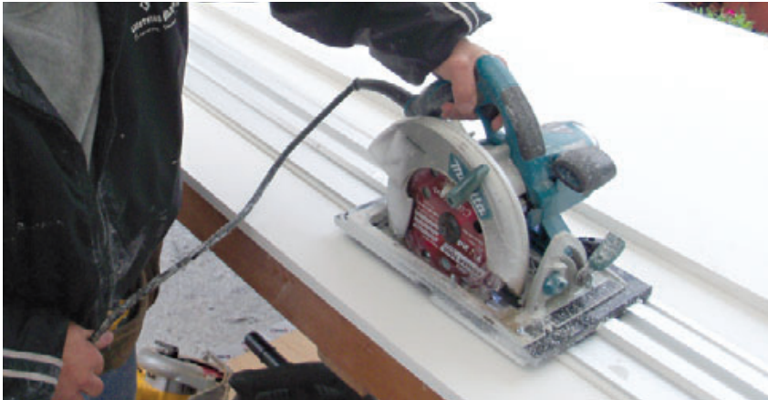
Figure 8. The author uses a track saw to create exterior trim of any width from \frac{3}{4} -inch PVC sheet stock.