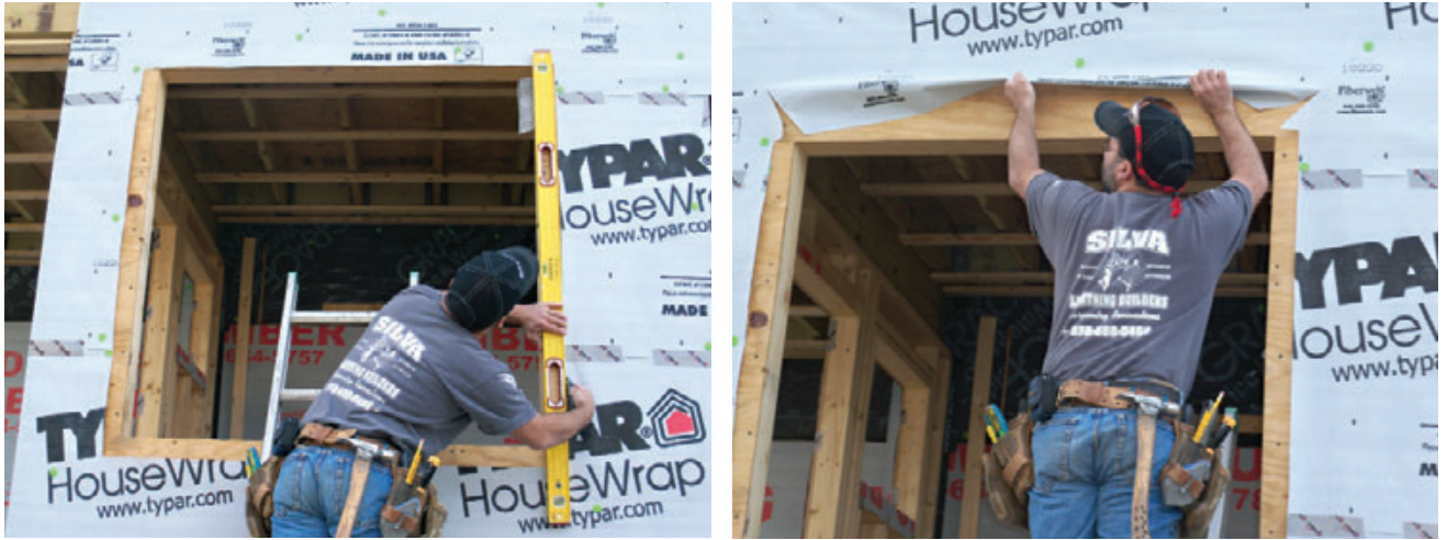
Figure 1. Once the housewrap has been cut back from the sides and bottom of the rough opening by the width of a level (left), a flap along its upper edge is temporarily tucked out of the way (right).