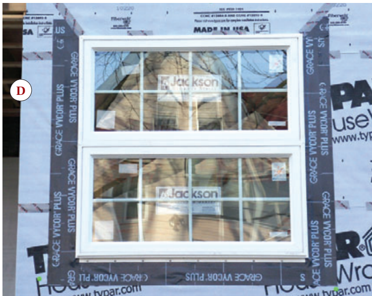
Figure 7. Outer flashing goes on over the window's side and top flanges (A, B). The flap of housewrap above the window head is then pulled down and taped in place over the head flashing (C, D).

flap that extends above the opening — starting from the corner but leaving a narrow connecting piece at the top — before completely cutting the other end free and folding it down against the sill (Figure 3, page 3). Once I've worked my way halfway down the sill, I cut through the last bit at the far corner with a quick jab of my utility knife and fold down the rest of the flap. This two-stage approach makes the material easier to control and helps prevent the formation of wrinkles and air bubbles.