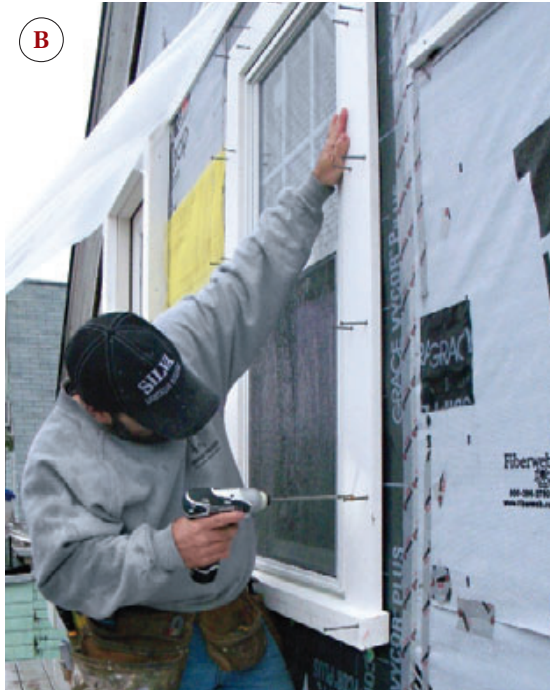
Figure 11. Once the trim unit has been tacked in place and leveled, the screws are driven home, starting at the bottom (A, B). A PVC trim band covers the outer row of screws (C, D); the remaining holes are plugged.

The head and side casings each get a double bead, while the narrower sill gets a single bead.