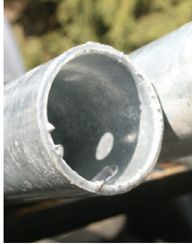
Figure 2. A thick coating of zinc protects the steel piles from corrosion.