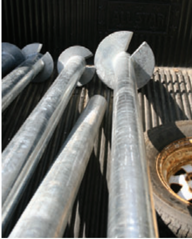
Figure 1. Helical piles are screw-shaped plates welded to a steel shaft. Various sizes are available for different soils and applications.