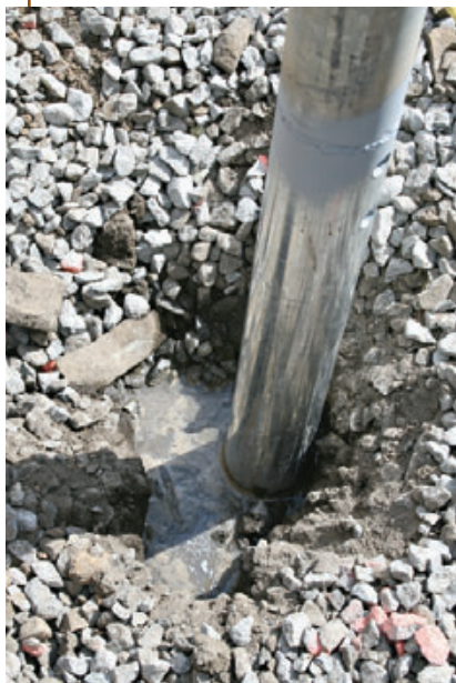
Figure 11. It would have been impossible to dig a traditional footing in this ground without it filling with water.