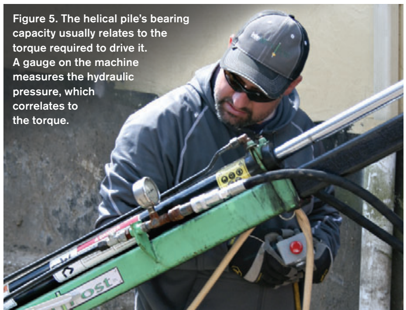
Figure 5. The helical pile's bearing capacity usually relates to the torque required to drive it. A gauge on the machine measures the hydraulic pressure, which correlates to the torque.

Helical piles are screwed into the ground to below the frostline using hydraulic machinery (Figure 4). The load-bearing capacity of a helical pile