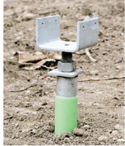
Figure 3. Several types of caps are available to attach piles to framing. Some can be adjusted in height to fine-tune a deck's elevation.

the contractor to inquire about what he had used. His answer — helical piles — changed my business.