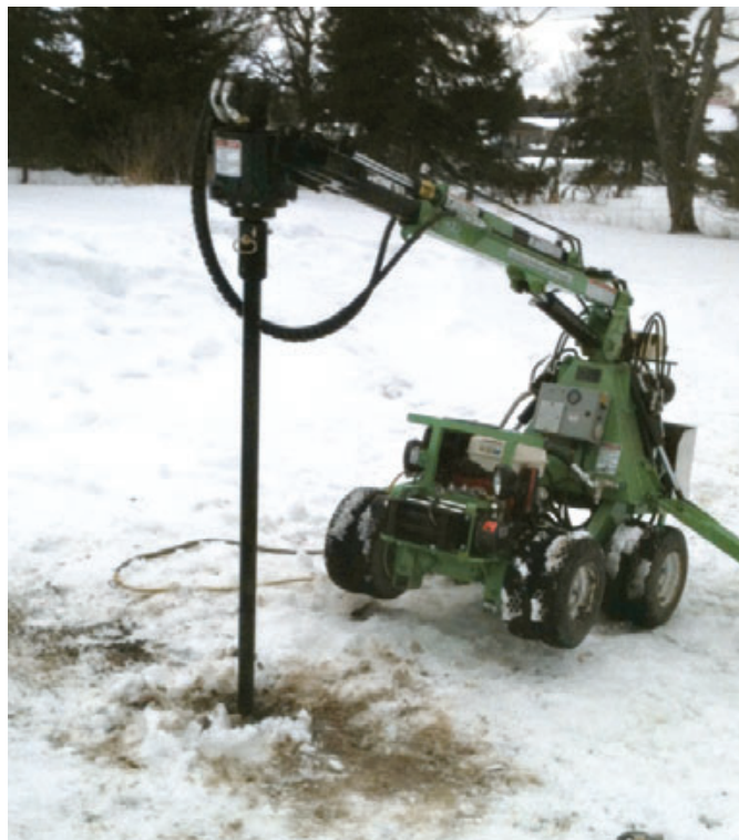
Figure 10. Driving a helical pile in frozen ground begins with inserting a proprietary heating rod in a hole drilled with a rotary hammer (above). Once the ground is warmed, the pile is driven normally (right).