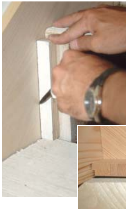
Figure 3. Interlocking joinery is key to a tight, quiet stair. Accurate dimensioning of the components ensures that the final assembly is plumb and square. Cutoffs from a tread and riser serve as marking gauges for layout.

For each staircase, I cut patterns from the end of a tread and riser to mark all the tread and riser locations on the closed skirtboard (Figure 3). The inside stringer is routed to house the treads and risers, while the open skirtboard is cut out and mitered back to the risers. I use a site-made gauge — a notched piece of scrap riser stock — to mark the cutout locations on the