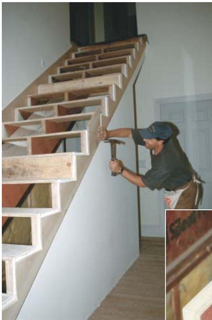
Figure 1. Although rough stringers are seldom perfect, LVL stringers (inset) are far less prone to shrinkage distortion and are useful for spanning exceptionally long stair flights.

Headroom height is a problem I encounter from time to time (Figure 2, next page). It may be a bit tricky to calculate all the floor-to-ceiling relationships during the framing stage, and the discrepancy may be less than an inch, but "sympathy" isn't listed in the building inspector's handbook. If the finished tread thickness will compromise the minimum allowable vertical distance between the stair nosing and the