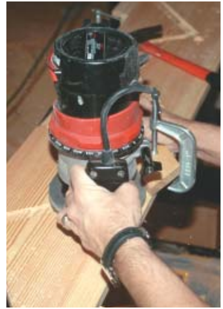
Figure 6. A Forstner drill bit outlines the nosing profile on the housed stringer. The housings are completed with a wobble-dado blade in a radial-arm saw and cleaned up with a straight bit in a hand-held router.

outline the cut first with a regular carbide blade in the radial-arm saw. After dadoing, a straight bit in a router cleans up minor irregularities.