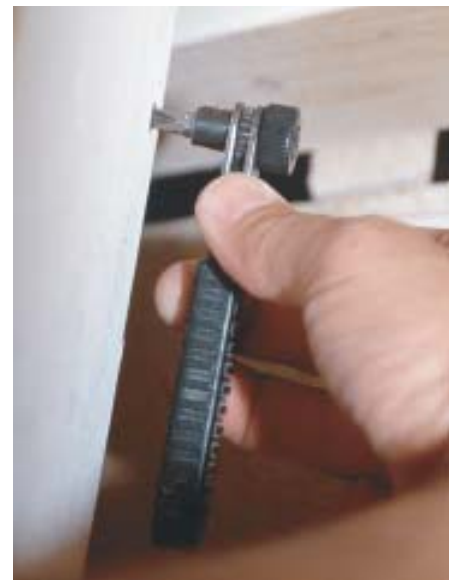
Figure 7. When there's no room for a screwgun, the author uses a hand-driven, right-angle ratcheting screwdriver to draw the tread tight to the next riser up.

After the risers are fitted and nailed, I install the treads, starting at the bottom. I connect each tread at the back edge