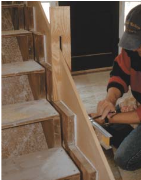
Figure 4. A disposable site-made gauge is used to mark the open skirtboard for mitered riser returns. A level line pulled from the bottom of the gauge marks the tread cutout.

With both skirtboards marked, I begin the process of cutting and routing. I use a Rockwell Sawbuck, a sliding compound saw with a 16-inch cross-cutting capacity, to cut the mitered outside skirt, carefully drawing the blade along the cut line to the intersecting tread mark (Figure 5). I