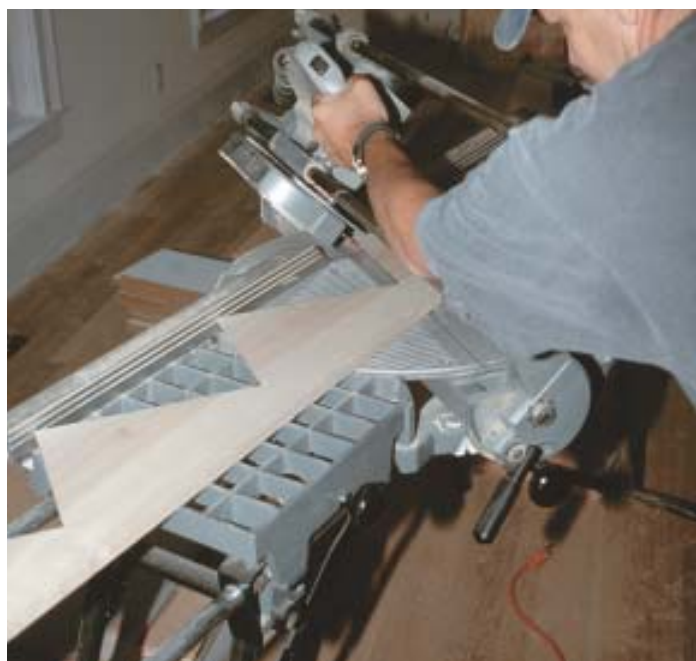
Figure 5. The author uses a Sawbuck to make clean, accurate mitered skirtboard cutouts. The inside corners are completed with a hand saw.

first. To plow the recess, I use an 8-inch adjustable wobble-dado blade in my radial-arm saw (Figure 6, next page). The wobble blade does a reasonably clean job of plowing, but the grain of some wood species is prone to tear-out, so I check the cut's quality on scrap lumber. If there's tear-out, I'll