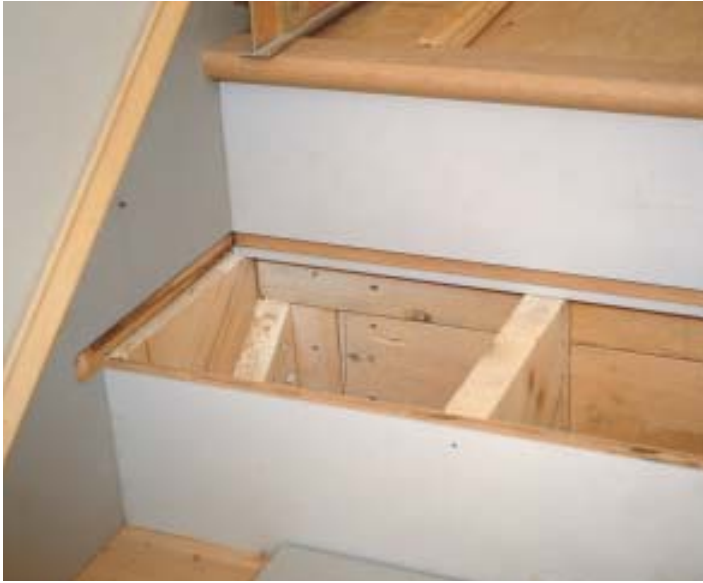
Figure 8. By piloting the connecting screw at the lower edge of the riser dado, the author takes advantage of the screw's displacement to force the rabbeted tread upward in the groove as it's drawn in, tightly closing the joint. A generous bead of construction adhesive permanently fills the gaps and eliminates movement.