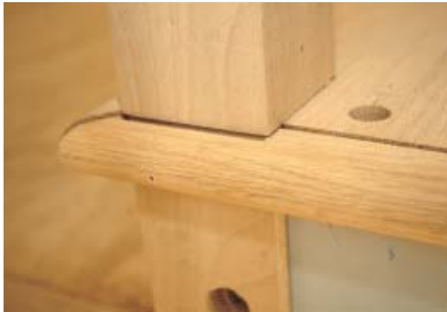
Figure 9. Tread end caps look better than a simple end-grain round-over. They're glued and nailed on after the tread is installed.

through the bottom edge of the next riser up. When space is too tight inside the cavity to point a screwgun at the back of the riser, I use a right-angle, ratcheting screwdriver. I've had it for many years, and it seems tailor-made for the job (Figure 7, previous page).