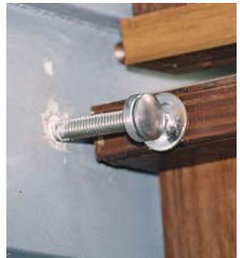
Figure 7. In the New Orleans area, wood structures cannot be attached directly to a house, so the author secures fence sections abutting the home with stainless-steel carriage bolts that pass through eyebolts into brass inserts epoxied into the framing. This method prevents direct wood-to-wood contact and allows inspection during annual termite treatments.

Down here in New Orleans, Formosan termites are a serious problem. If you attach any wood structure to the house, the termite guys want a sighting gap, so