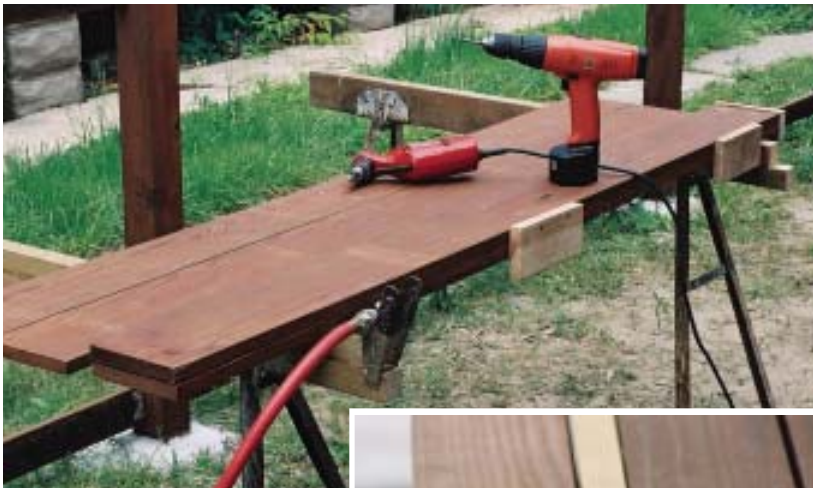
Figure 5. The screw pattern on the first full-sized fence board is laid out by hand, but then it becomes a jig for the rest of the boards when the author screws registration blocks on one end and one side (above). Smaller boards next to the post get their own jig. A WL Fuller Co. tapered bit (401/467-2900, www.wlfuller.com ) does the drilling and counter-sinking in one step (right).