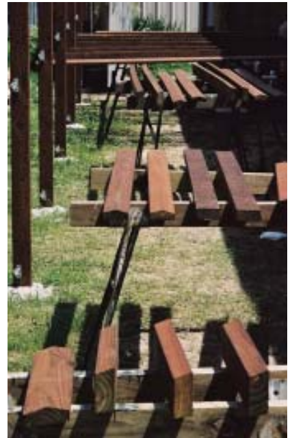
Figure 2. The top of every horizontal member gets a 15-degree bevel to shed water and debris. Rain grooves on the bottom of the top rail break surface tension so that water drips off instead of following the fence to the bottom.

Next I sorted through all the shaped rails and placed the best pieces toward the front, with increasingly twisted ones