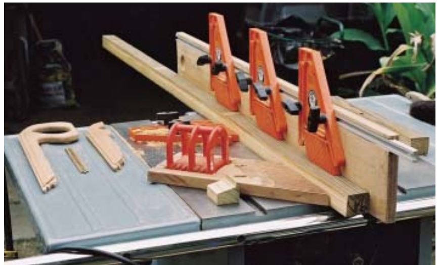
Figure 3. Feather boards prevent kickback and help produce better-quality saw cuts and dados. A sturdy magnet holds the shop-made wood feather board on the saw's cast-iron table. The plastic feather board mounted on the table in the miter-gauge slot and the vertical feather boards on the rip fence are made by Bench Dog Tools.