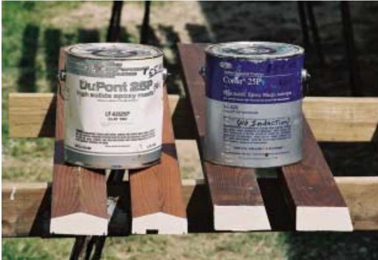
Figure 9. Designed primarily for industrial applications, two-part coatings have better adhesion and a higher percentage of solids than conventional one-part paints. The author uses them to prevent water from entering vulnerable end grain (left and below left). Bending the handle on a foam brush makes coating the bottom of fence boards easier (below).