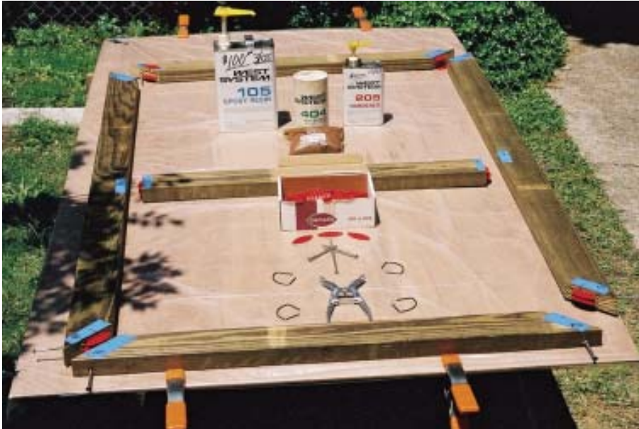
Figure 8. The gate's mitered corners are assembled with 4-inch stainless-steel screws, Lamello K-20 plastic biscuits, and two-part epoxy. Ulmia miter clamps from Garrett Wade (800/221-2942, www.garrettwade.com ) hold the assembly together while the epoxy sets. The author prefers an intermediate rail to the more traditional diagonal brace because it matches the rest of the fence and provides space to mount the latch.