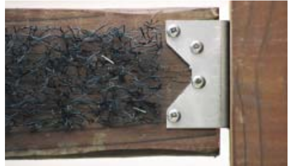
Figure 6. A 1/8-inch gap behind the fence boards — created by fastening Enkamat to the rails with stainless-steel staples — keeps water from being trapped (left). Similar gaps are left where the horizontal rails meet the posts. The author fastened the L-shaped brackets securing the rails with 1½-inch-long #8 pan-head screws and oriented them so that the brackets are hidden behind the fence boards (above). Some rail ends were cut on a slight angle or bevel to match warped or twisted posts.

for pilot holes — which, though they are not absolutely necessary, make installation much easier. Plus, level screws look better on the finished product.