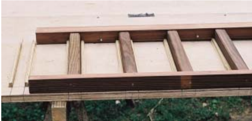
Figure 4. The 2x2 spindles capping the fence are laid into the jig and screwed to the rails with 3-inch-long #7 trim-head screws. The tops of panels are predrilled and screws are started to make final assembly easier (above). Keeping the spindles away from the posts helps hide slight discrepancies in the panel caused by warped posts and varying panel sizes (right).