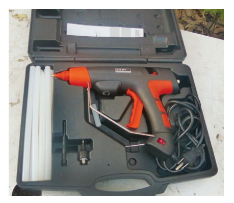
In addition to the glue gun, the PamTite kit's sturdy plastic case conveniently holds twelve 1/2-inch-by-10-inch glue sticks as well.

edges of the sashes and inserting either Q-Lon foam seals or silicone bulbs—a method that doesn't detract from the historic appearance. When this weatherstripping is loose at the ends of the grooves, I'm using the hot-melt to secure it while I return the window to the frame. Where window parts are worn and the fit is loose, a bit of hot-melt can make them work like new with no milling required. I also just used the gun to fix some leaky French doors and to glue plastic shims behind door hinges to realign the doors with their jambs.