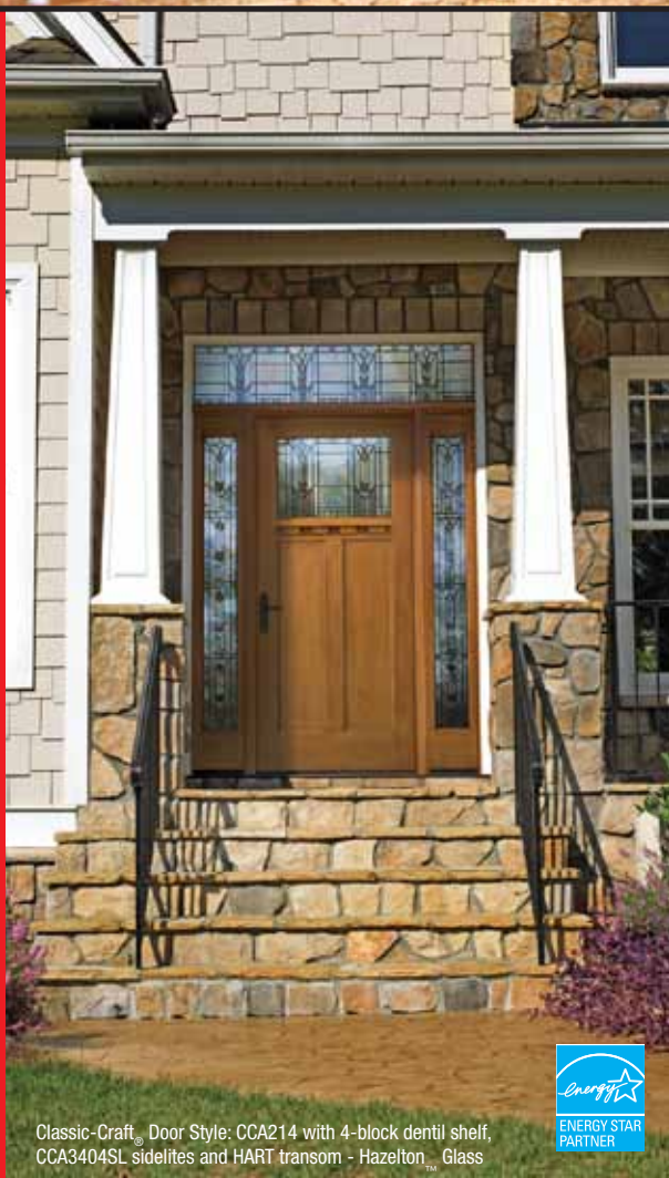
Classic-Craft,® Door Style: CCA214 with 4-block dentil shelf, CCA3404SL sidelites and HART transom - Hazelton™ Glass