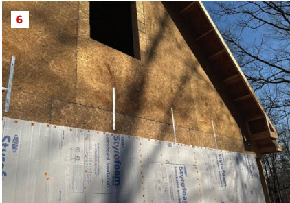
6 Gable-end trusses were tied to the gable-end walls with metal straps. To meet Fortified Gold, the size, frequency, and nailing needed to be specified by an engineer.