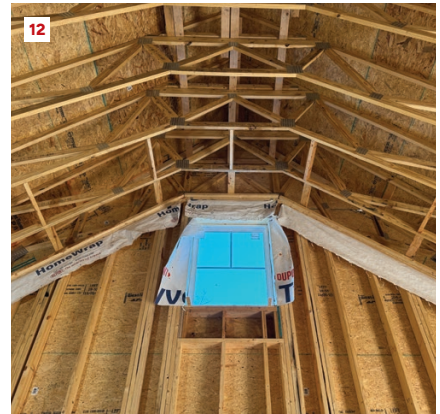
Horizontal bracing ties the gable-end truss to the next two scissors trusses.