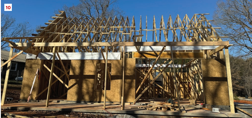
Scissors trusses over the great room (to the right) bear on 10-foot walls. The bonus trusses (on the left) sit on 9-foot walls.

trusses. The raised heel gave us the vertical space we need to get full insulation thickness over the exterior wall plates. Without that space, insulation can get compressed at the eaves and lose its effectiveness, something we were absolutely trying to avoid, especially since this project is aligned with net-zero performance goals.