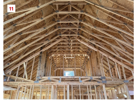
The “bonus” trusses have a parallel-chord floor structure where mechanicals will run.

A big advantage of using engineered trusses is clarity. The whole system—roof, attic floor, load paths—is designed by the truss manufacturer, eliminating the need to interpret prescriptive framing tables or spans. On this project, our manufacturer used MiTek design software, which allowed them to generate a 3D model of the entire truss system. Before we placed an order, we reviewed that model to make sure everything