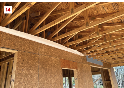
To keep the porch ceiling level, the porch trusses bearing on the 10-foot walls in the great room drop down 12 inches and include a 1 1/2-inch space between the drop-down and the wall to fit continuous insulation.

easier everything becomes when you prioritize design and communications on the front end—modeling, aligning with the truss designer, and making sure every trade partner understands the plan. The work that happens before framing ever starts is what makes the rest of the build more predictable. And for us, that planning is what allows the home to perform—not just structurally, but thermally, mechanically, and as a complete system.